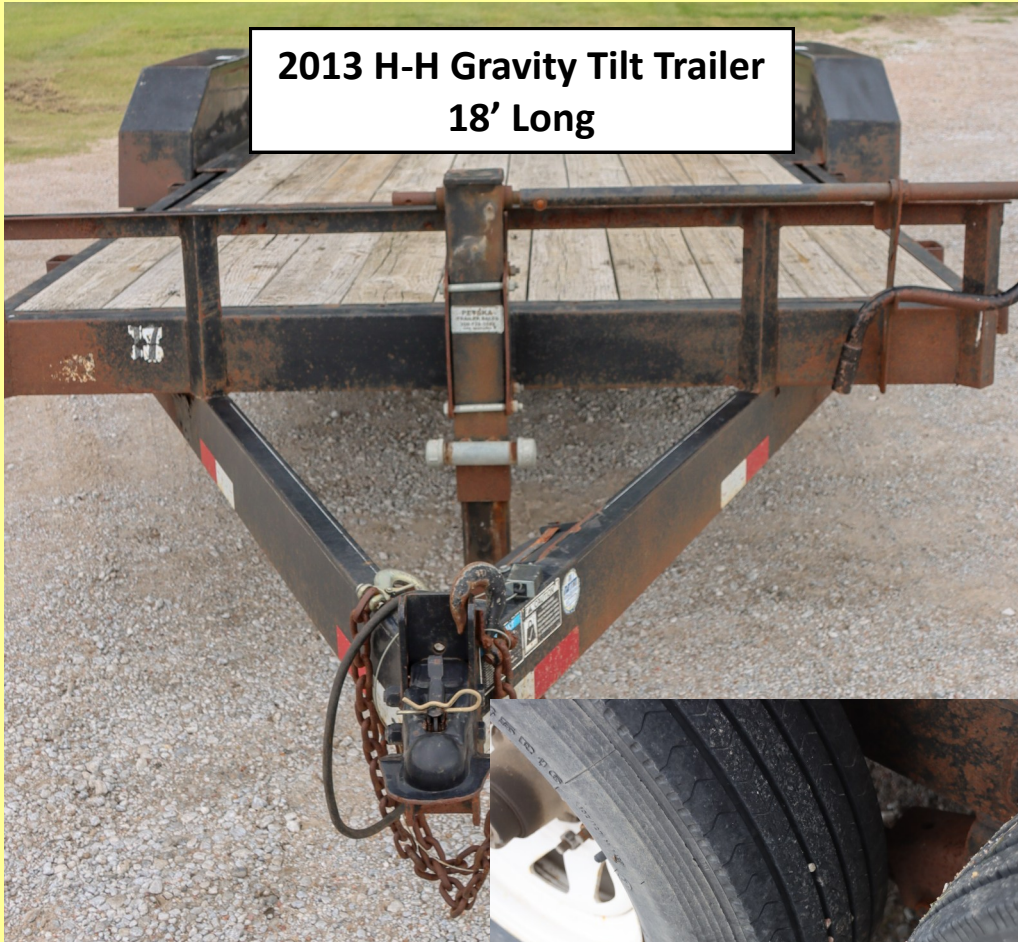
2013 H-H Gravity Tilt Trailer 18' Long