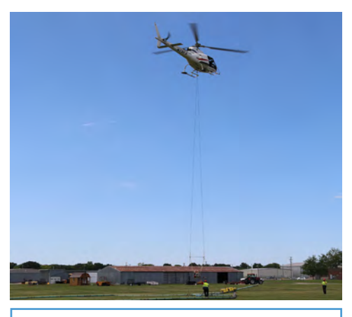
Study flight begins in Columbus.

Naprstek said that the flights were funded under a collaboration between nine NRDs, including the Lower Loup, and the Nebraska Department of Natural Resources.