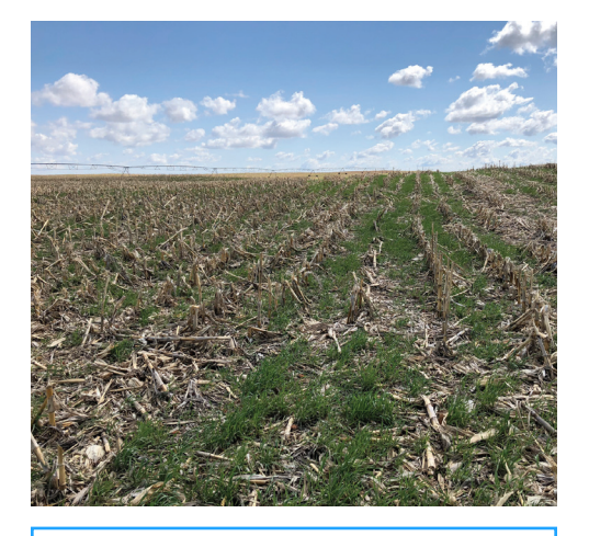
Cover crop water usage is examined

soil health and reducing erosion, but there is limited information available that quantifies the impact of cover crops on groundwater recharge. This was the finding of an in-depth